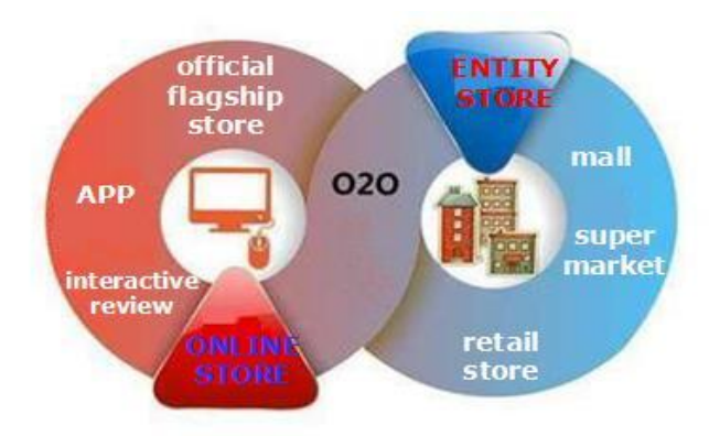
Figure 1: O2O Business Model

China's mobile Internet has entered a period of rapid development since 2009. According to iResearch's statistics, as of 2012 July, China Internet users reached 538000000, Internet penetration rate is 39.9%, the number of mobile phone has eclipse desktop and laptop computers as the primary way people access the internet. Mobile phone users reached 388000000, of which 3G users have more than 80000000. <sup>[2]</sup>And showing characteristics and trends of that: mobile phone network video user growth is strong, number of micro-blog users undertaking a stable growth period, mobile phone micro-blog is maintaining rapid development, the growth of network shopping users tends to be stable, payment of Internet banking and online application, IPv6 address number is increasingly growing to the third place of the global ranking. <sup>[3]</sup>