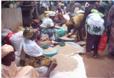
Fig 2: A Cluster of Local Rice sellers in Bisi Market at Ado-Ekiti. In Ekiti State, the marketing industry is rigidly organized around women as they engage more in mobile trade. They patronized the rice millers in Igbemo and extend the sales of the product to local and regional markets. Constrained by limited access to formal education, their activities still lack modernization. This is demonstrated in the manner they display the milled rice on mats and nylons on the ground in market places – another major source of contamination.

Generally, women occupy low- pay jobs and work in the informal sector occupations such as street vending and market work (Ashford, 2001). Their involvement in food distribution, however, is to gain economic independence from husbands to meet various obligations to family and friends (Makinwa-Adebusoye, 1991).