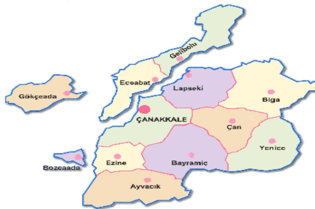
Fig. II: Map of Canakkale Region

These enterprises consist 98% of the business front, averagely. The research's being in that group becomes more important when the enterprises and the founders are affected by the high level and growing of rivalry conditions.