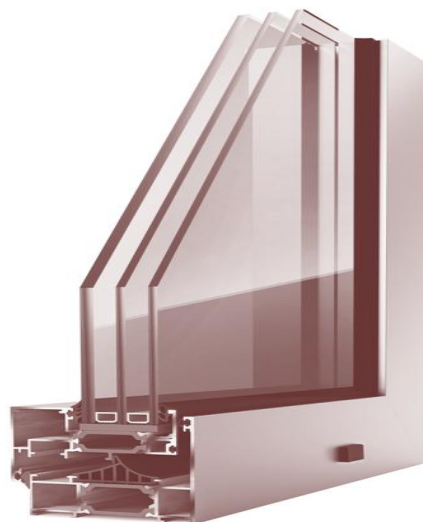
Figure (2) The design proposed by the researcher for sound and heat insulation window