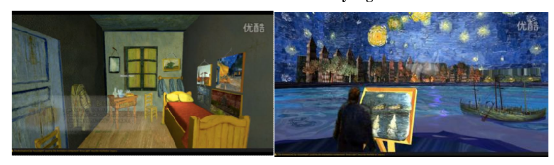
4.2 The set style of sound system, aimed audience favor and user experience 4.1the Ariel room 4.2the starry night of Ronald River

This topic selected a higher popularity of Van Gogh's paintings, the paintings of graphic elements into threedimensional elements, select a few picture styles, the team decided to paint in accordance with the style of painting. The pre selected Japanese Yamato-e, low style (Figure 4.1 and 4.2), but after making the demo we found that other style to use for the essence of Van Gogh paintings cannot be interpreted in a proper way, mixture of the type may be lose the understanding of the original painting. Think twice about making a model map using only the elements in Van Gogh's paintings to create the application. In the sense of hearing systems, the symphony is used as the background music, which can be used to display as a background track. We refer to a lot of foreign literature such as the design psychology editor by Nelson. We consider the many user preferences and other factors, in foreign shows more than half of the tickets is selling to older customers, to delve into deep reason. we can find out that compared to the young people ,the older viewer's knowledge of reserves is relatively deeper, young people on the meaning of the painting will not understand enough. So it is necessary to increase their participation in the general presentation in another different way.