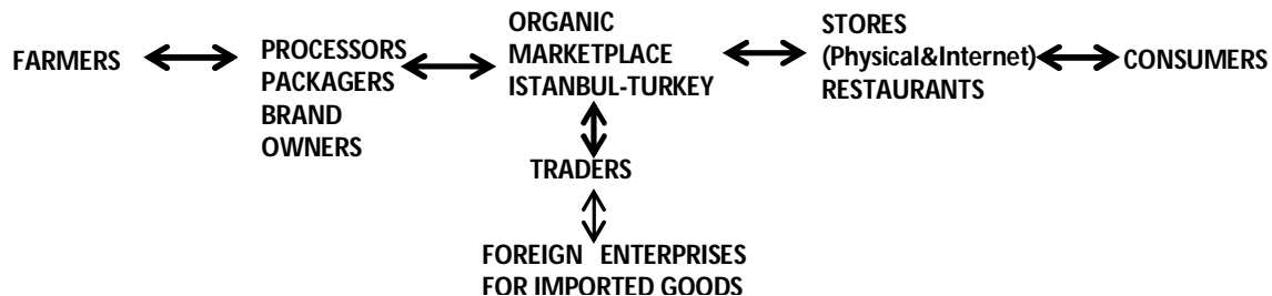
Figure 4. Organic market extended supply chain with external actors