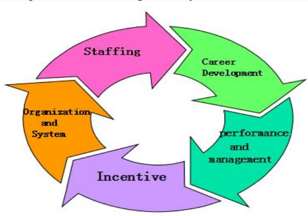
Rolling development of human resources

SAIC 's performance management system is divided into two part and two levels: organizational performance and