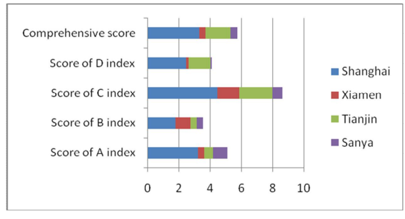
Fig. 2 Score and ranking of each index for four big cities