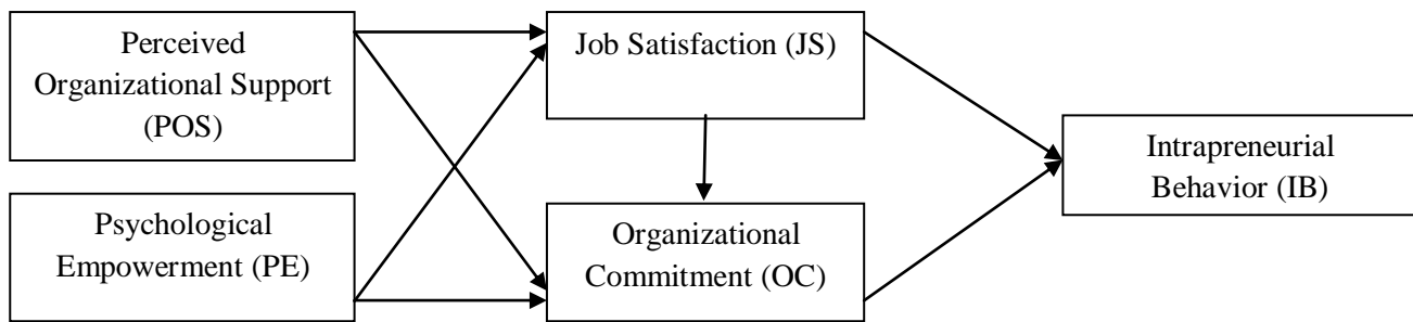
Figure1. Conceptual framework of study

However, relationship between organizational commitment and intrapreneurial behavior among personnel needs to further investigated. Based on entrepreneurship literature, numerous studies investigated the factors affecting organizational entrepreneurship (Intrapreneurship), but examine how psychological empowerment (PE), perceived organizational support (POS), job satisfaction (JS), organizational commitment (OC) and intrapreneurial behavior (IB) among personnel of one organization interact, merits further investigation, especially in the context of agricultural organizations in Iran country (see figure 1). The model tested in this study integrated perceived organizational support (POS) and psychological empowerment (PE) to analyze the mediating role of job satisfaction (JS) and organizational commitment (OC) on agricultural personnel's intrapreneurial behavior (IB). Therefore, the hypotheses of study were as follows: (1) JS partially mediates the relationship between POS and PE with IB; (2) OC partially mediates the relationship between POS and PE with IB; (3) OC partially mediates relationship between JS and IB; (4) JS partially mediates the relationship between PE and OC; and (5) JS partially mediates the relationship between POS and OC.